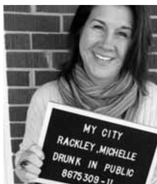
Magazine Layout Designer