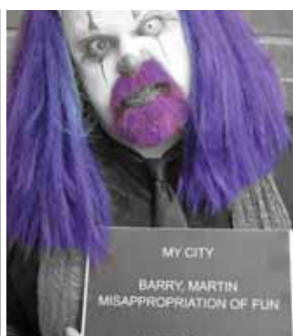
Comic Stripe Illustrator / Columnist