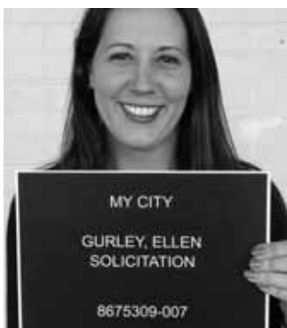
Owner / Editor