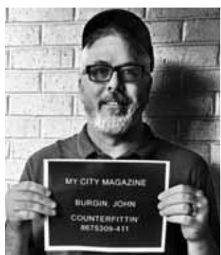
Comic Stripe Illustrator