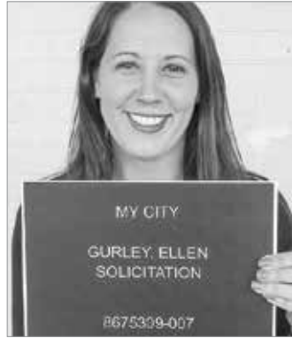
Owner / Editor