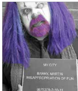
Columnist / Comics