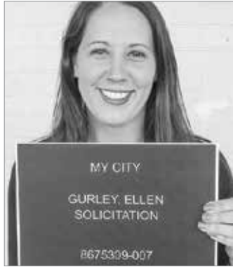
Owner / Editor