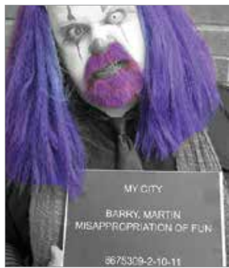
Columnist / Comics