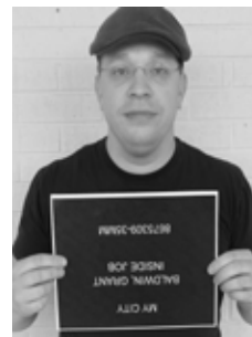
Grant Baldwin Photojournalist